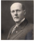
Paul Harris Founder of Rotary