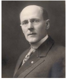
Paul Harris Founder of Rotary